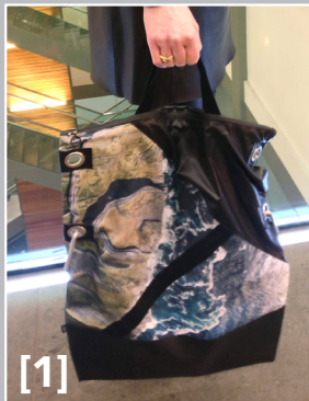
[1] "HANDY" HANDLE