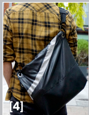
[4] FLIP IT FOR HIGH VISIBILITY (REFLECTIVE STRIP)