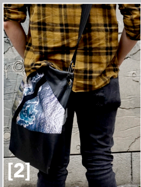
[2] CLIP HIGH OR LOW +WEAR OVER THE SHOULDER