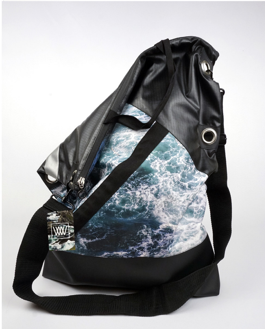
SEABIRD SWIRL WBW100_SBS