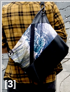
[3] CLIP LOW / WEAR HIGH – SLING IT LIKE A MESSENGER